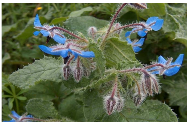
Figure 1: Borago officinalis .

The drug consists of dried leaves of Borago officinalis Linn. (Boraginaceae). An erect, spreading hispid annual biennial plant. The plant found mostly in Mediterranean region, Europe, Northern Asia, it is also report to be planted in Indian gardens. The plant occurs during November to January. In India plant is sparsely distributed in Northern eastern Himalayas from Kashmir to Kumaon at altitudes of 3,500-4,500m 1 .