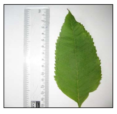
Figure 2: Leaf macroscopy

The following macroscopic characters for the fresh leaves (Figure 2) were noted: size and shape, colour, surfaces, venation, presence or absence of petiole, the apex, margin, base, lamina, texture, odour and taste<sup>6, 7</sup>.