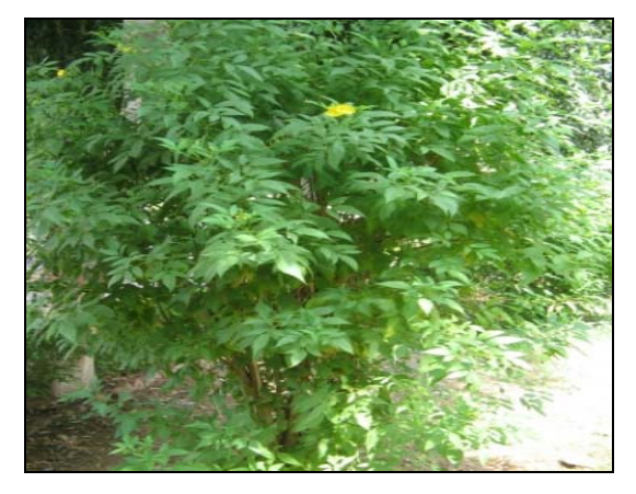
Figure 1: Plant photograph of Tecoma stans linn

Tecoma stans also known as yellow elder (Figure 1) is an erect shrub or small tree up to 4 m tall. Leaves are opposite and imparipinnate. In India, it is known as Sonapatti in Tamil language, Pachagotla in telugu language and korenekalar in Kannada language<sup>1</sup>. Yellow elder has been used for a variety of purposes in herbal medicine. Its primary applications have been in treating diabetes and digestive problems. Extracts from Tecoma stans leaves have been found to inhibit the growth of the yeast infection<sup>2</sup>. Some drugs of plant origin in conventional medical practice are not pure compounds but direct extracts or plant materials that have been suitably prepared and standardized<sup>3</sup>. The World Health Organization (WHO) has recommended the use of derivatives arthemisinin from Artemisia annua a Chinese herb with (Composite), established pharmacognostic data, as a first line drug in the treatment of malaria<sup>4, 5</sup>. Establishment of the pharmacognostic profile of the leaves of Tecoma stans linn will assist in standardization, which can guarantee quality, purity and identification of samples.