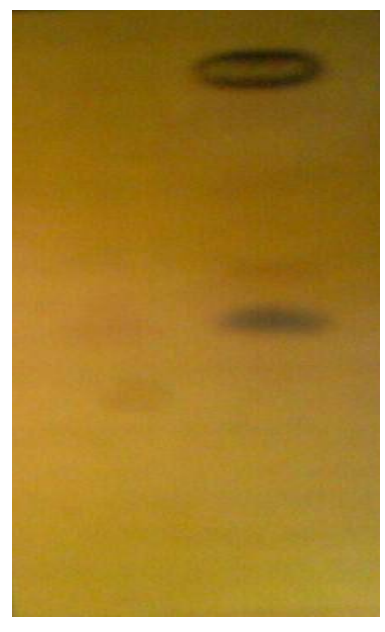
Figure.6: TLC profile of test solution of Terminalia Arjuna Stem bark (Test solution derivatiged with ferric chloride solution Elaagic Acid Standard)